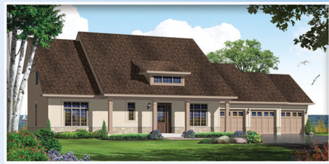
Bungalow Loft Elev-B -2061 sq.ft.