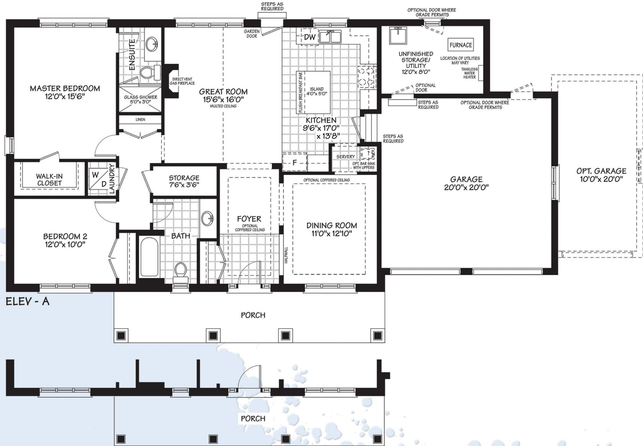
ELEV - A