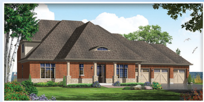
Bungalow Loft Elev-A -2083 sq.ft.